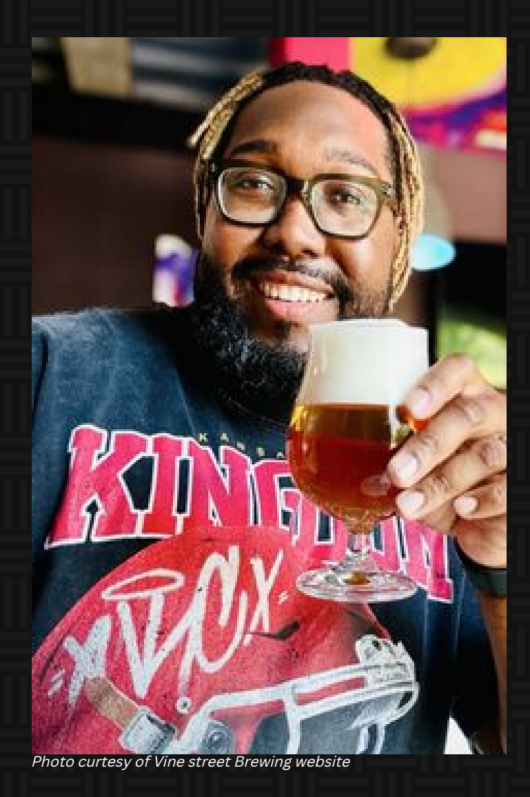
Kansas City G.I.F.T. is proud to support their journey and help them thrive!

Expanding production Creating jobs Driving revenue growth Bringing representation to craft beer